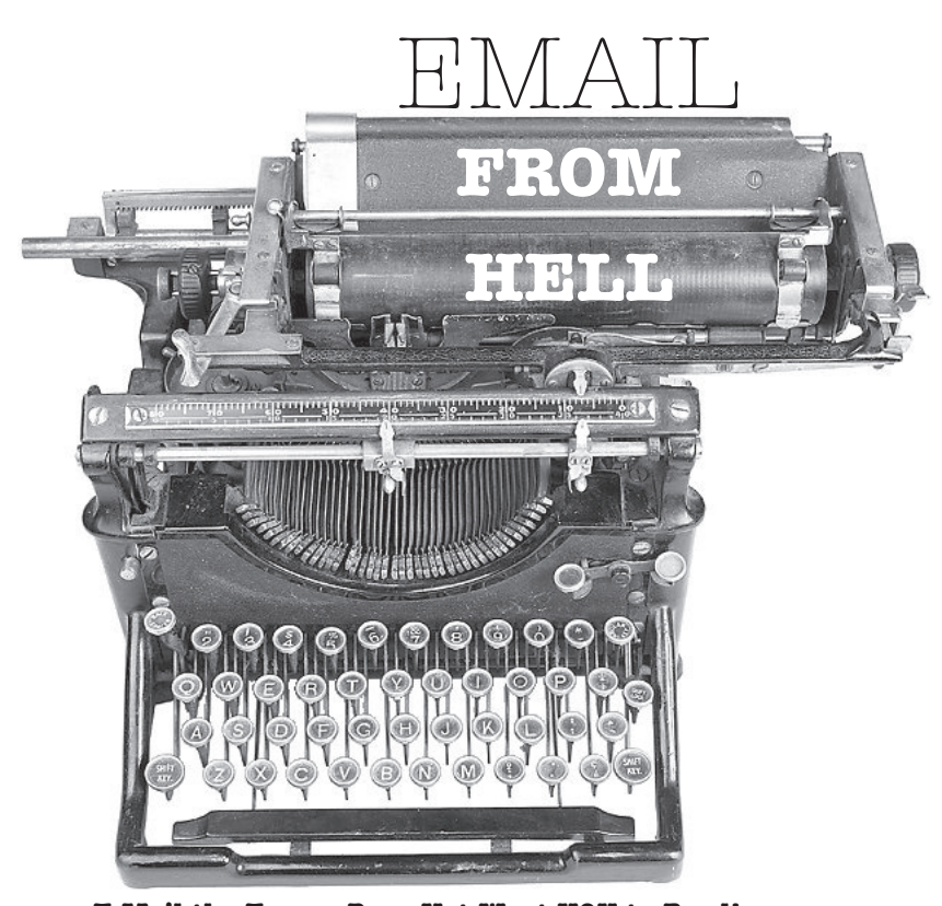
E-Mail the Enemy Does Not Want YOU to Read!